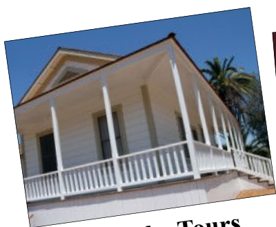
Sikes Adobe Tours